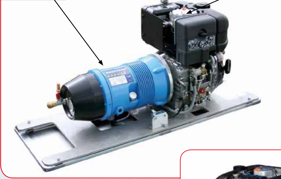
Air pressure outlet